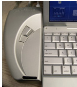
BookEndz on a 12" PowerBook

You can find more information here at the BookEndz website.